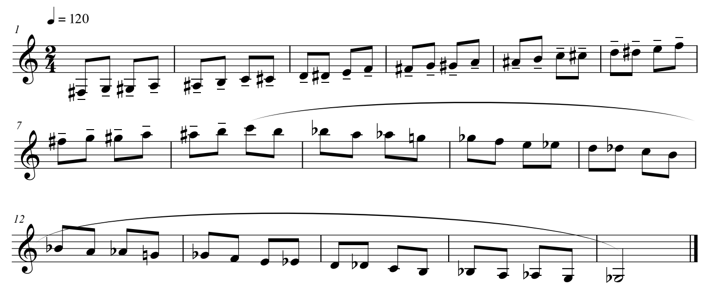
Track 2: Etude - J.B. Arban, Characteristic Study No. 1, Complete Conservatory Method Allegro Moderato -96